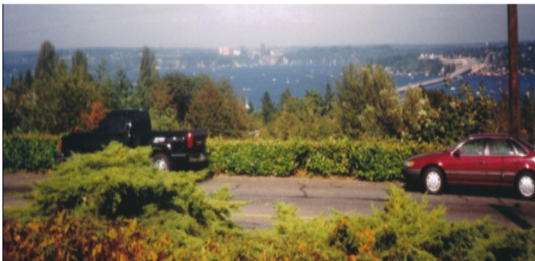
View from western edge of Colman Park circa 1995