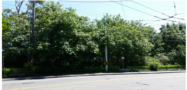
Recent View of Colman Park