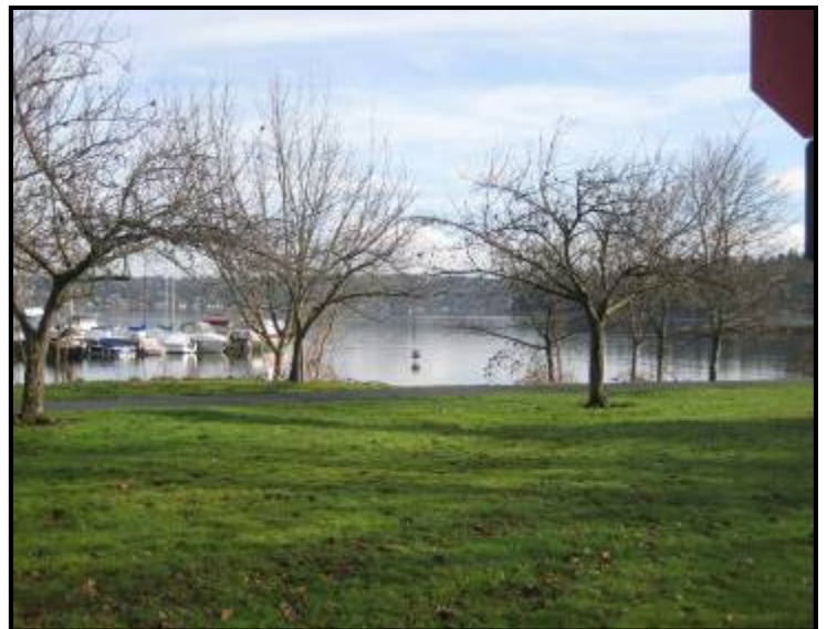
Proposed sewer overflow reduction tank location