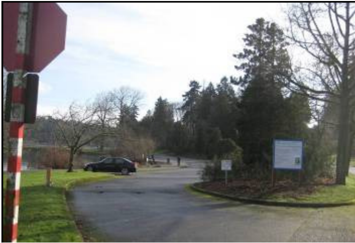
53rd South and Lake Wash. Blvd.—Lakewood Marina area

Community project update: Two basins in the site and design phase will greatly impact users of Lake Washington Blvd. Representatives from Seattle Public Utilities (SPU) have conducted significant community outreach, and have come up with preferred alternatives that arose from these community meetings. We are pleased that they asked what the community thought and acted upon it. SPU is working with the mayor, the city council and parks to have these sites approved. Their preferred alternative site for Basin 43 is the parking lot just south of the Lakewood Marina at 53rd Avenue South and Lake Washington Blvd. This 250,000 gallon tank will be underground, as will be the odor control facility. The above ground structures - hatches, stacks, air intakes and exhaust pipes will be above ground but are promised to be low profile and camouflaged. This site is a direct result of the last community meeting where neighbors attended and suggested this as a much less intrusive alternative than those previously considered. Their preferred alternative site for Basin 40/41 is the parking lot at 49th Ave. S. and Lake Washington Blvd. This will be a 440,000 gallon tank, underground, and exterior structures will also be low profile and camouflaged.