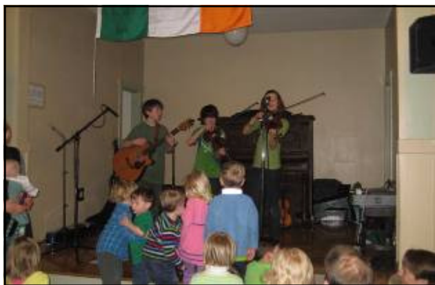
Great Celtic music performed by our talented friends in the Onlies Band

Our guests spanned in generation from babies to great grandparents. What a great way to celebrate safely in the community!