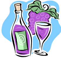
Wine tasting 4/16