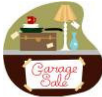
Garage sale 5/7